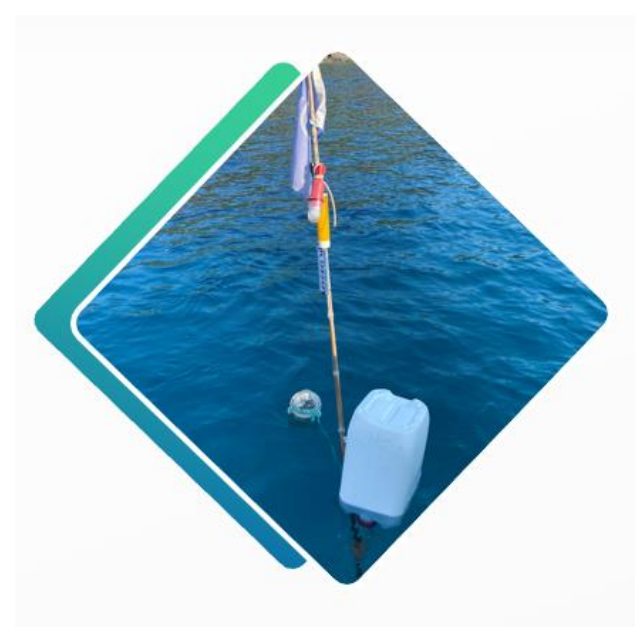
Fig.3: E-GEAR tag fishing data close to anchored fishing net