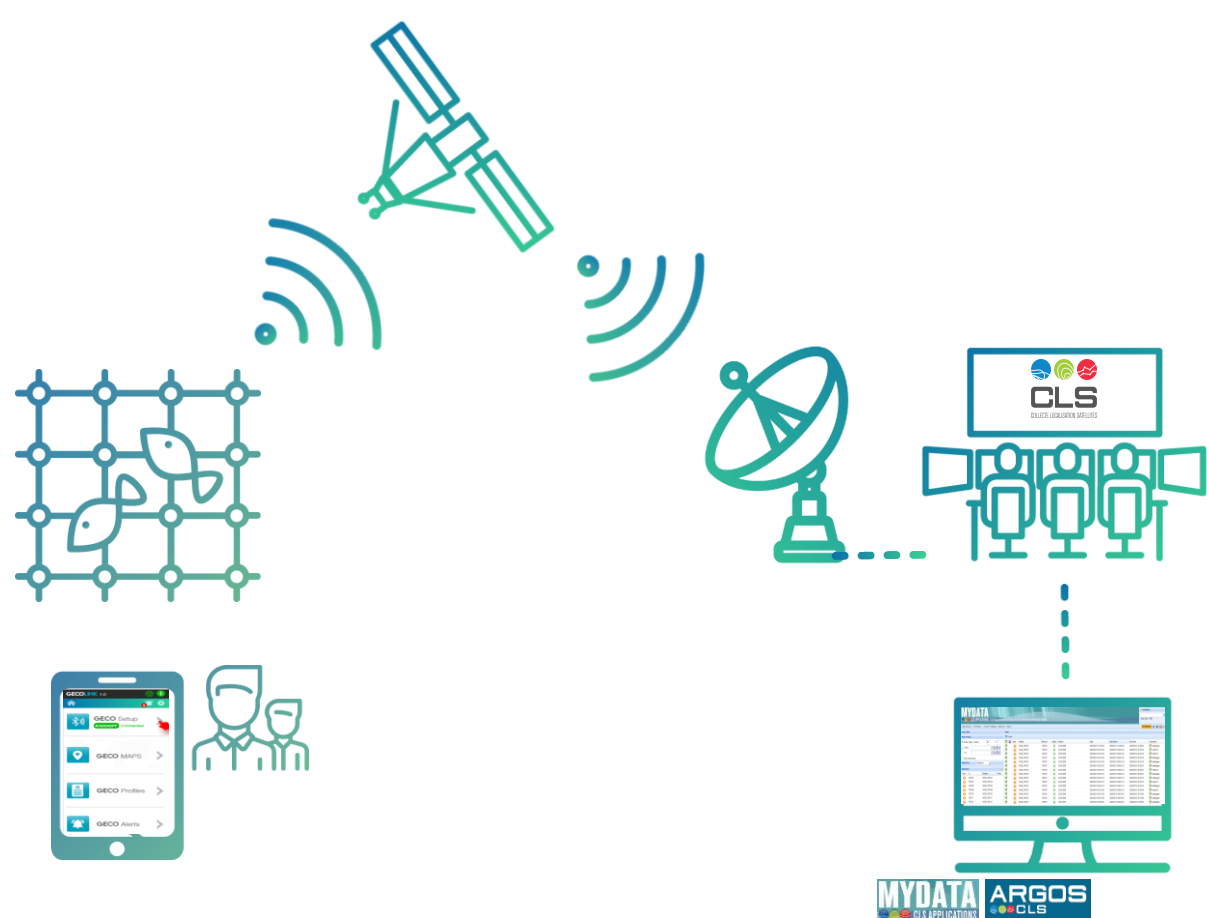
Fig.5: E-GEAR data flow