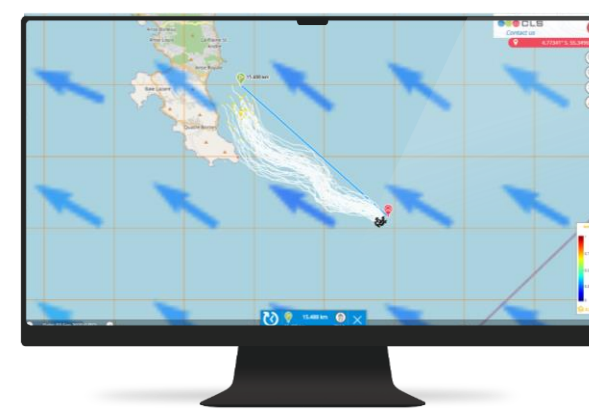
Fig.4: Drifting simulation, visualisation of data

Satellite connectivity used to be a limiting factor for ocean observation capabilities and network, due to form factor, energy and cost. Newspace and KINEIS connectivity is challenging this and opening up new opportunities such as the E-GEAR program which intends to propose citizen science and collaborative efforts to collect information at sea, beyond other operational benefits for the fishermen and fisheries stakeholders.